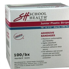
Adhesive & Elastic Bandages