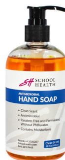
Soaps & Dispensers