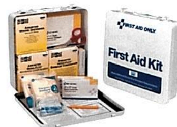
Standard Bus Kit #1597439