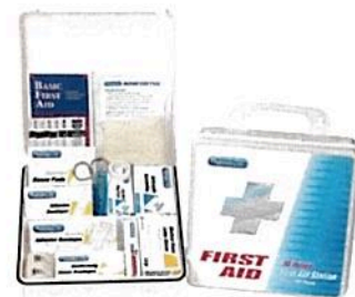
50 person First Aid Station #1440800