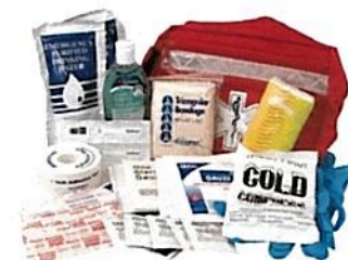
Field Trip Kit #1400517

First Aid: A first aid kit should be readily available wherever children are in care - including during field trips, outdoor play, and transportation. First aid kits should be kept out of children's reach. The nurse's office and/or reception area should have one, plus other areas including chemistry labs, art, or industrial classrooms.